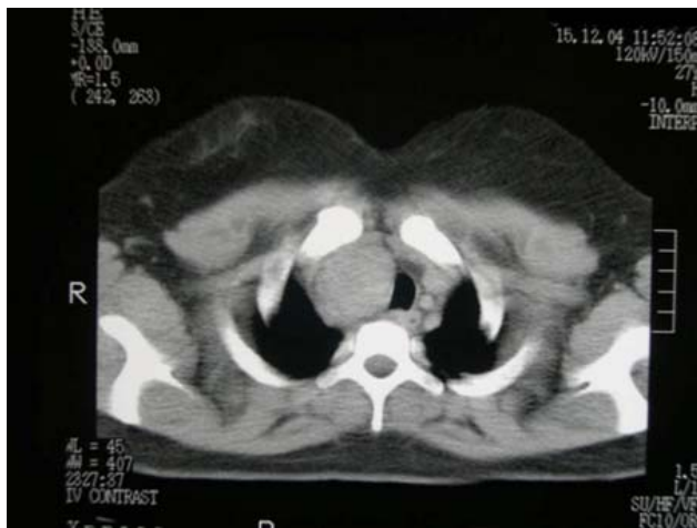
Figure 1: The compression of the mass on the trachea results in the narrowing of lumen size.

benign character. The mass was totally excised under general anesthesia and the compression on trachea was relieved (Figure 2). Histopathological examination demonstrated a well-encapsulated lesion, with hyalinized follicular centers and prominent interfollicular vascular proliferation. The diagnosis was consistent with “hyaline vascular type Castleman's disease” (Figure 3). At one and a half years' follow-up, the patient remains free of disease and complaint of chronic dyspnea has totally disappeared.