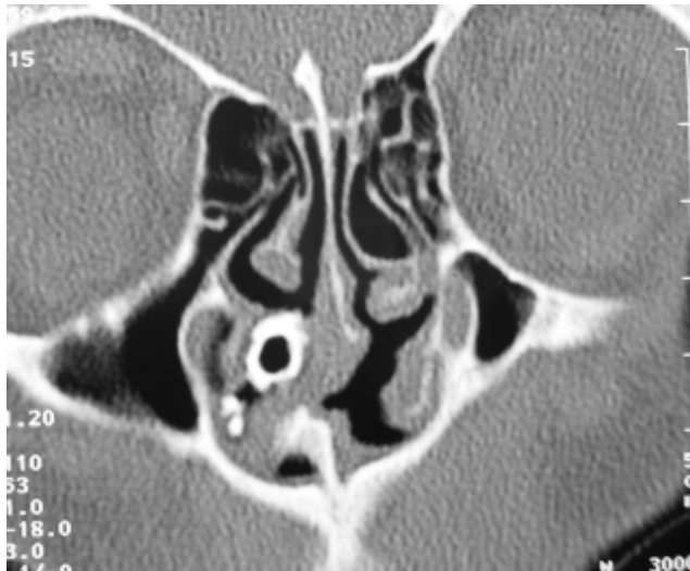
Figure 1. The preoperative CT scan demonstrating the right nasal septal papilloma and the rhinolith occluding the inferior meatus.

increase owing to precipitation of salts and ongoing mineralization on its surface 3 . A rhinolith existing for a long time tends to cause erosion of septum between nasal fossa and maxillary sinus, as well as resulting in the formation of bony or cartilaginous sequestrum 3 . Such a lesion may even give the impression of a osteogenic sarcoma or cause palatal perforation 4,5 . To our knowledge, their co-existence with nasal septal papillomas or any other benign or malignant neoplasia have not been reported in the literature up to now 3 .