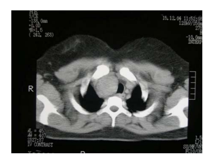
Figure 1: The compression of the mass on the trachea results in the narrowing of lumen size.

benign character. The mass was totally excised under general anesthesia and the compression on trachea relieved (Figure 2). Histopathological examination demonstrated well-encapsulated a lesion, with hyalinized follicular centers and prominent interfollicular vascular proliferation. The diagnosis was consistent with "hyaline vascular type Castleman's disease" (Figure 3). At one and a half years' follow-up, the patient remains free of disease and complaint of chronic dyspnea has totally disappeared.