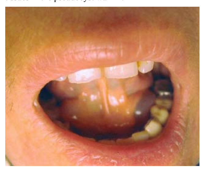
Figure 1. Intraoral view of the bilateral ranula

The differential diagnosis of ranula should include masses and swellings in the floor of the mouth and submandibular space region. These are dermoid and epidermoid cysts, branchial cleft cysts, thyroglossal duct cysts, cystic hygroma, lipomas, abscess, and malignant neoplasia<sup>6,7,10</sup>. Histologically, ranula consists of a central cystic space containing mucin and a pseudocyst wall composed of loose, vascularized connective tissues. Histiocytes predominate in the pseudocyst wall, but over time, these become less prominent. An important feature in the histologic diagnosis is the absence of epithelial tissues in the pseudocyst wall<sup>8,11</sup>